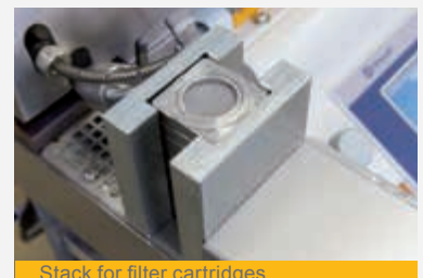
Stack for filter cartridges