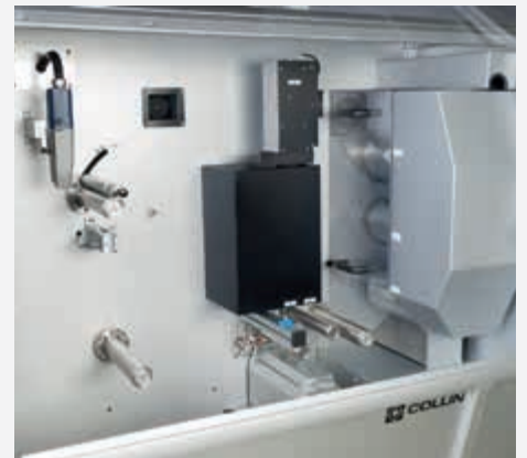
Optional marking system