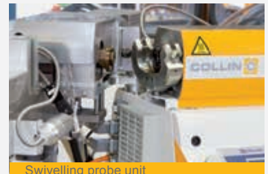
Swivelling probe unit