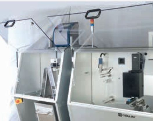
Additional equipment COFICOS