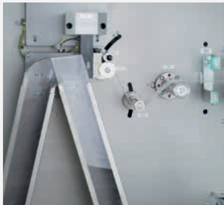
Optional cutting device