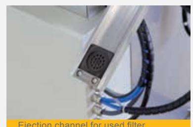
Ejection channel for used filter